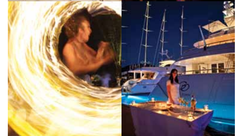
The Full Moon White Party featured fire dancers and stilt walkers to the delight of the guests; the evening ended with a fireworks display that lit up the night sky.