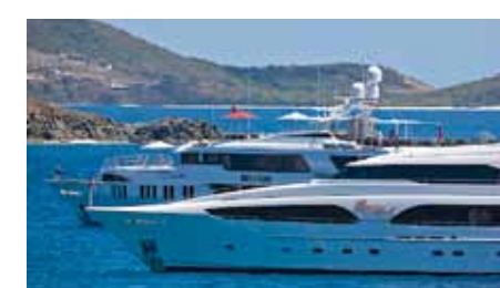
Four days of competitive racing and yachting fun began with a ribbon-cutting ceremony celebrating the opening of YCCS Virgin Gorda.