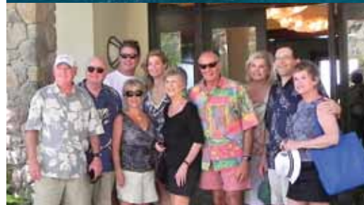
Eight of the attending motor yachts began a cruise-in-company through North Sound to Peter Island. Rendezvous participants enjoyed the spectacle of the rare "super moon"—when a full moon coincides with its closest approach to earth for stunning results.