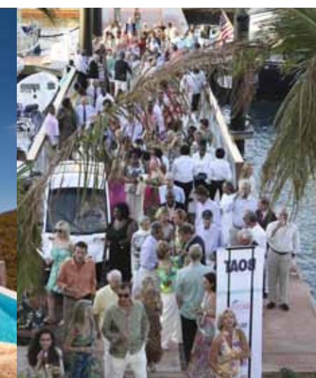
Falcon's Nest (left), a private villa atop Peter Island, received the guests of the Rendezvous to view the regatta racing. Yacht owners and guests enjoy cocktails and conversation at the ribbon-cutting ceremony (above).